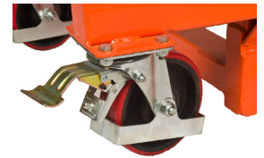
Steering wheel with brake